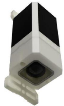
Forward facing option also available

Compared to our existing Time-Lapse Camera models, the incredible High Quality (HQ) Camera module offers a higher resolution (12 megapixels, compared to 5 megapixels) and the ability to record image bursts of up to 10 images at a user-defined framerate. Especially when the time-lapse imagery is used as input for operational computer vision algorithms, the superior image quality of the HQ Camera is to be preferred.