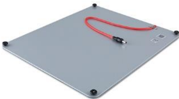
Back View of External Solar Panel with Cable