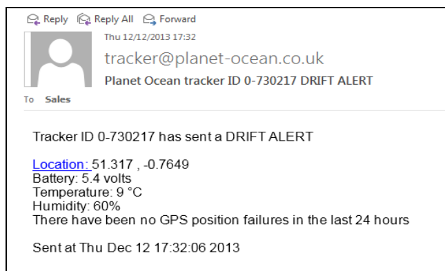
Typical Alarm Message

Type: 64 Parallel Channel Accuracy: 10m (nominal) Update Rate: 1 second Protocol: NMEA-0183 Sensitivity: -159dBm Watch circle radius 500m standard, 1500m optional